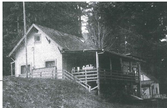
McLanes Cove/Stadium School built in 1911 – closed in 1918

With grapes, berries, poultry on a well fed soil. With nature's best pictures to spur us to toil. With roads, clubs and schools our constant aim. If you settle at Grapeview, you'll be glad you came.